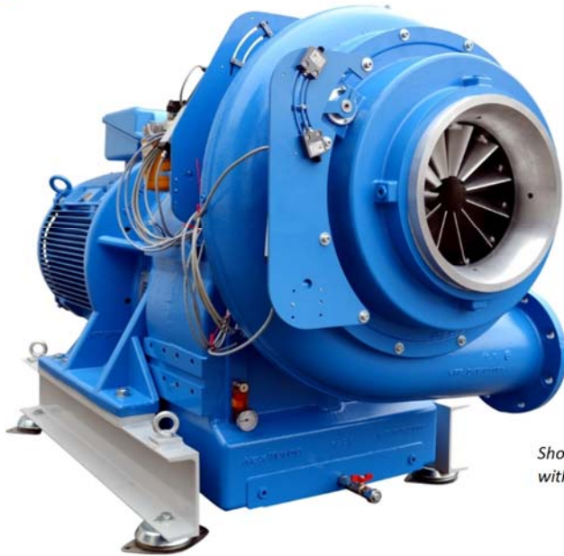
Shown model in B5 console configuration with flanged motor, and XY control