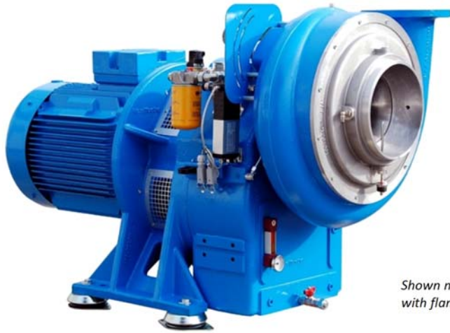
Shown model in B5 console configuration with flanged motor