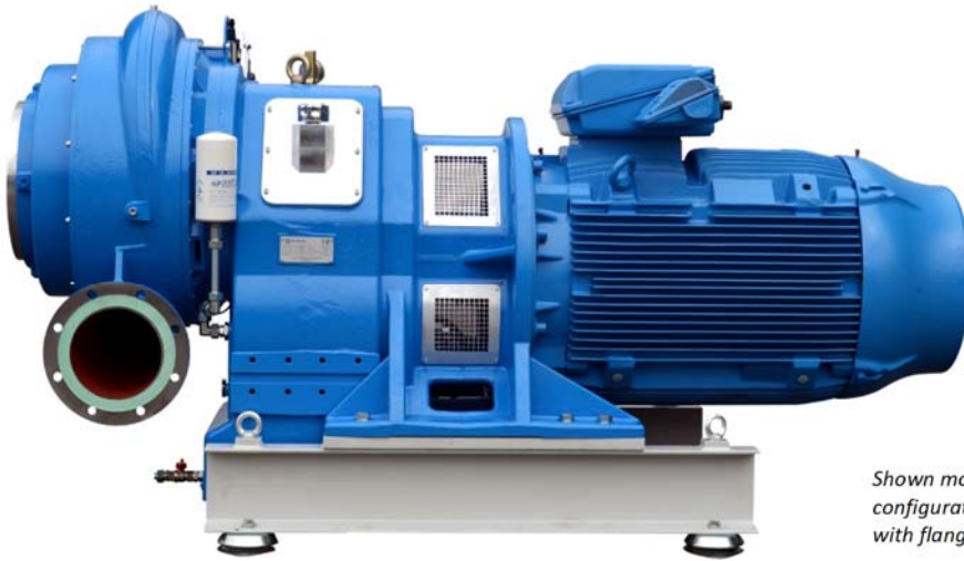
Shown model in B5 console configuration with flanged motor